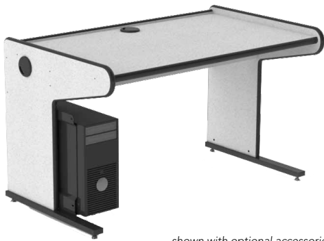
shown with optional accessories

The CF series all laminate workstation is a great solution for any computer classroom. The stations are designed to link together to form rows using starter and add on stations, sharing components saves space and cost. Laminate leg assemblies have a durable metal base and are constructed from 1" panels laminated on both sides. Laminate work surfaces feature a 1/4" thick high pressure laminated MDF core with Polyurea spray applied Armor Edging. Full width wire management trays are accessible from the top and underside of the station to conveniently store power and data cabling. Our CFC series adds a desktop carrel that provides a private and quiet work space for students. The carrel top provides 14" h side and back panels and is designed to link together just like the standard CF series.