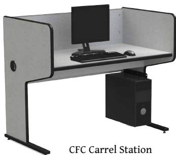
CFC Carrel Station

*When adding carrel option, alter model number. Example: CFC-2430.S