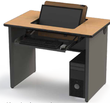
shown with optional accessories

The SRI flip top computer workstation offers a simple and clean solution for multi-purpose classrooms. The flip up monitor design stores a flat panel monitor out of sight when not in use. This allows the work surface to be clear for writing and lecture. To expose the monitor simply extend the keyboard and the monitor rotates up, push the keyboard back in and the monitor returns to its closed position. The station is complete with a wire management tray to solve the problem of unsightly power and data cables. All welded base frame components and heavy gauge steel panels, 1" thick laminate work surfaces, and our durable Armor Edging form a superior work station. Height dimension listed is to bottom of work surface, for overall working height add 1" for thickness of top. A non-flip top standard work surface is also available.