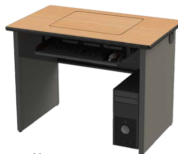
Hidden Monitor View