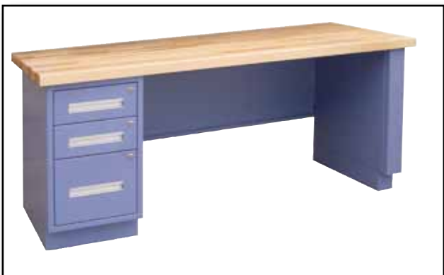
DT-6-GA Work Station

Pre-Engineered work stations are equipped with a 4" x 4" full width wire management tray.