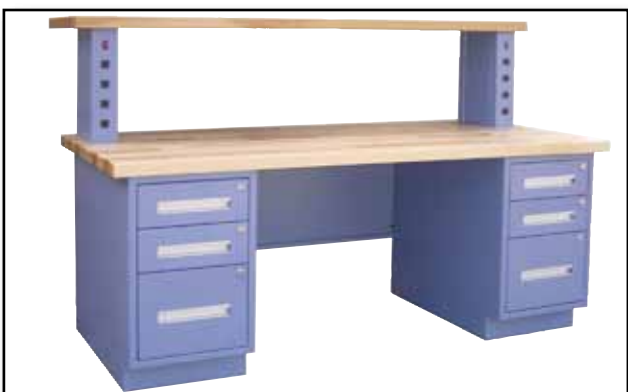
DT-6GG-Z Work Station