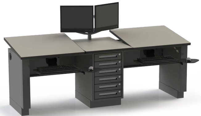
shown with optional accessories

Dura-Tech drafting stations are constructed from 16 and 18 gauge all welded base components with a 1" thick laminate drafting area and 1" laminate reference area. All tops are edged in 3MM PVC edging. These stations feature a rear modesty panel and an integrated wire tray for easy wire management. Units are available with a 10-position adjustable work area or a fixed 7 degree surface. A dual station configuration is also available. Stations come standard in a 28" height. Height dimension listed is to bottom of work surface, for overall working height add 1" for thickness of top. Storage cabinets are available in six configurations.