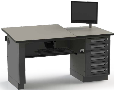
shown with optional accessories