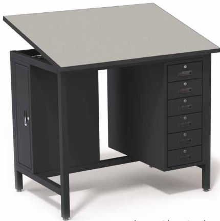
shown with optional accessories