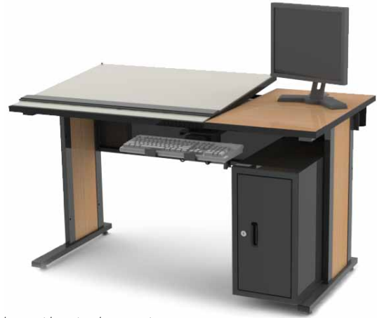
shown with optional accessories

GSC Traditional style drafting stations are available in several configurations and sizes to fit a variety of applications. All of the base units feature adjustable height legs and a 10 position-drafting surface. The surface is made from 1" thick laminate with a 3MM PVC edging for protection, held up by 1½" tubular all welded steel. Units are available with optional reference area, board storage cabinet and six-drawer storage cabinet.