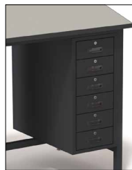
Six Drawer Cabinet (D)

The PC Series CAD/Drafting Station is one of our bestselling workstations; it is an ideal two-in-one space saving option. This well equipped desk has a lockable CPU cabinet, a low rear modesty panel, full-length wire management tray, pencil tray and floor feet levelers. The fixed work area is constructed from 1" laminate with matching leg panels and a 10 position adjustable drafting table. Height dimension listed is to bottom of work surface, for overall working height add 1" for thickness of top.