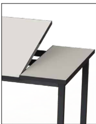
Base Table With Reference Area (R)