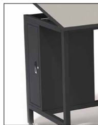
Board Storage (B)