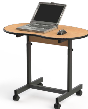
Mobile Version Shown

The ECR extruded aluminum base provides a sturdy table support with an attractive design. The 2" x 6" vertical column is also available with an optional side wire chase helping to keep wires and cables out of sight yet easily accessible. Laminate work surfaces feature a 1/4" thick high pressure laminated MDF core with our Polyurea spray applied Armor Edging. All tops feature a balance backer sheet. See color chart for standard and available color options. Also available in a mobile version. Height dimension listed is to bottom of work surface, for overall working height add 1/4" for thickness of top.