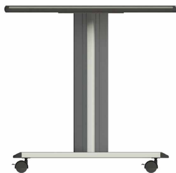
Side View (Shown w/ optional Casters)