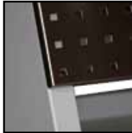
Tool Board Detail

Tooling carts provide a great way to store tools at the ready near your work or assembly area. Panel "A" frames attach to most GMI SC-Series carts. Tool panels are available in a variety of sizes and in both finished metal or stainless steel. Panels have .375" square holes on 1.5" centers and accommodate most tool holders designed for square holes on 1.5" centers. Standard color is structural gray. Special sizes and colors available.