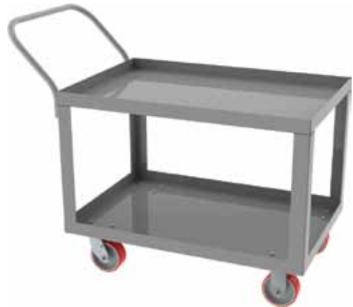
Low Profile Cart

General Purpose Utility Cart - 11 gauge steel uprights - 11 gauge steel shelves - Welded construction - Carts have 1-1/2" h retainer edges on shelves - (2) rigid and (2) swivel locking 5" heavy duty casters - 1500 lb capacity. Available in a 2, 3, 4, and 5 shelf configuration.