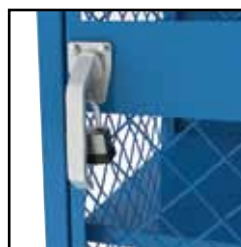
Secure locking handle accepts standard padlock.

Securely store expensive sports equipment in our sports gear locker - Storage locker is constructed from 16 and 18 gauge furniture grade steel - (5) fixed shelves - Steel exterior components feature all welded construction - Secure locking door with handle - Sturdy welded door hinges - Handle accepts standard padlock - Solid back panel - Wire mesh front and sides - Durable polyurethane finish - Available in several sizes.