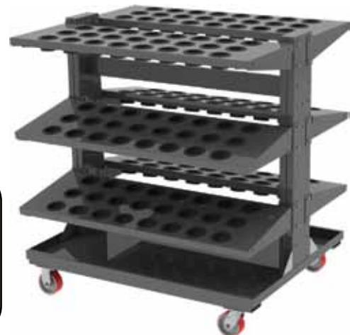
Dual Sided Cart