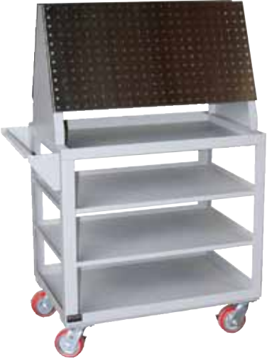
GMTP-1836 Panels shown with "A" frame assembly on SC-Cart

Tooling carts provide a great way to store tools at the ready near your work or assembly area. Panel "A" frames attach to most GMI SC-Series carts. Tool panels are available in a variety of sizes and in both finished metal or stainless steel. Panels have .375" square holes on 1.5" centers and accommodate most tool holders designed for square holes on 1.5" centers. Standard color is structural gray. Special sizes and colors available.