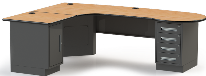
SRE-200 Model Right Hand Model Shown