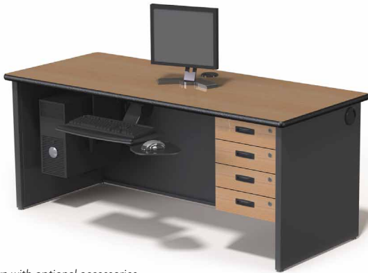
shown with optional accessories