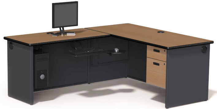
shown with optional accessories